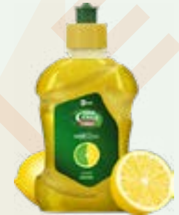
SUPER SWAB DISH WASH