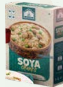
BALCK POUND SOYA CHUNKS