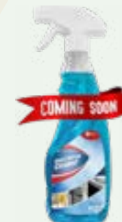
GLASS & SURFACE CLEANER